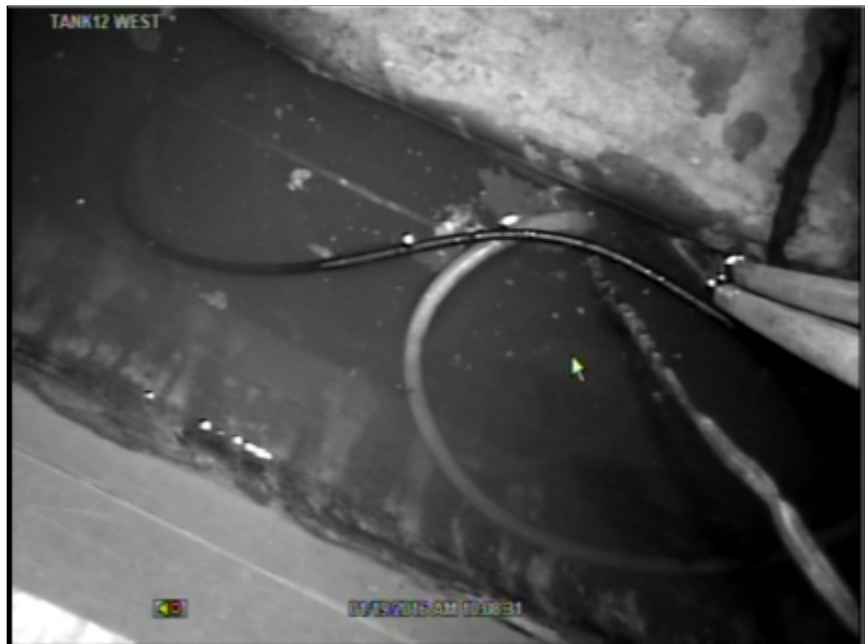
Figure 4. Groundwater In-Leakage in the Annulus, as viewed from the West Riser. Date of Video: January 19, 2016.

Placement of Lifts 2 and 3 in the Tank 12H annulus was delayed (ADAMS Accession No. ML16111B174) until 8 February 2016 (SRR-CWDA-2016-00068), due to groundwater accumulation in the annulus ( Figure 4 ) when the temporary ventilation system, which forced unheated air through the annulus, was shut off (ADAMS Accession No. ML16167A237). As expected, groundwater accumulated in the annulus faster when air was “pulled” under negative pressure than it did when it was “pushed” with positive pressure (ADAMS Accession No. ML16167A237 and SRR-LWE-2015-00048). DOE estimated that ~3,785 L (~1000 gal) of groundwater was pumped out of the Tank 12H annulus (ADAMS Accession No. ML16167A237), reducing the water level to no more than 5 cm (2 in). Any standing water remaining in the annulus when grouting began likely would have enhanced bleed water segregation in Lift 2 (cf. RPT-5539-EG-0016, Test 2), leaving an as-yet-unquantified impact on the hydraulic conductivity of the bottom layer of grout (i.e., Lift 2) in the annulus (cf. SRNL-STI-2012-00576).