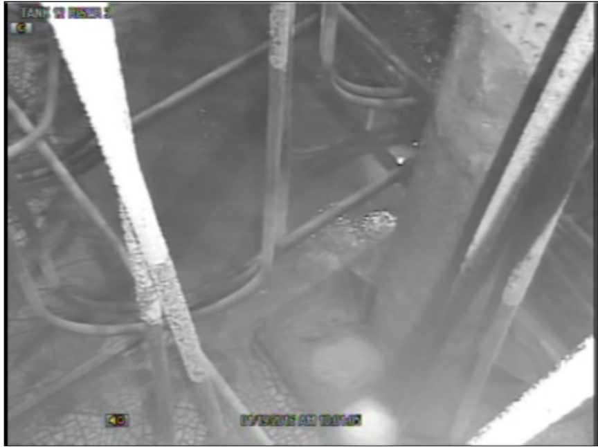
Figure 1. Residual WIR on the Floor of the Tank 12H Primary Appears Similar to Mud Cracks. Light Reflects off a Pool of Water beyond the Column in the Bottom Image. Date of Video: January 19, 2016.