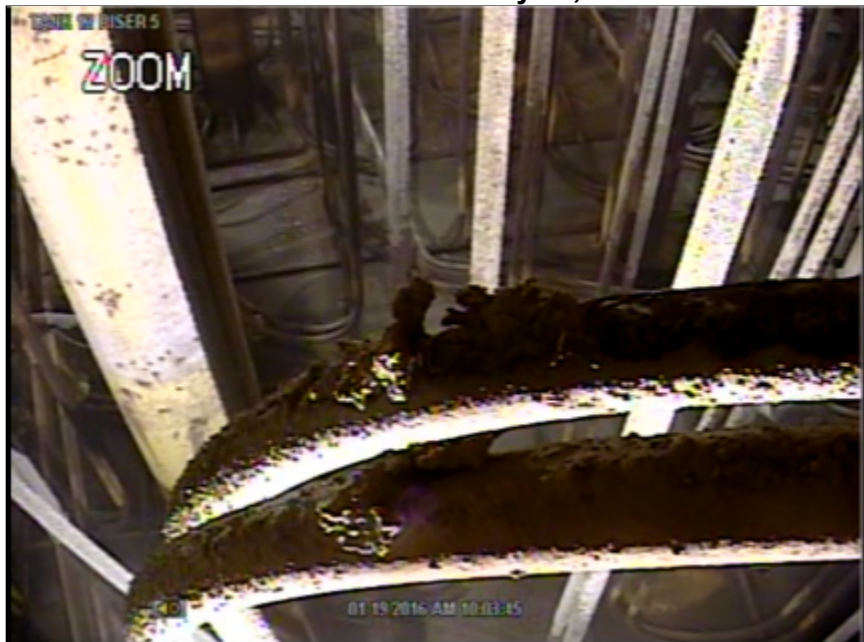
Figure 2. Residual WIR on cooling coils within the Tank 12H Primary. Date of Video: January 19, 2016.

The Tank 16H grout strategy indicated that having 8 to 10 cement mixer trucks in rotation was ideal (SRR-LWE-2014-00013), whereas the Tank 12H grout strategy later clarified that a grout delivery rate of 8 to 10 trucks per hour (SRR-LWE-2014-00147) was ideal. Eight to 10 trucks per hour converts to 49 to 61 cubic meters per hour (64 to 80 cubic yards per hour [assuming discharge of 6.1 cubic meters, 8 cubic yards or 1,616 gal of grout per truck], consistent with Section 3.6.1.2 of the procurement specification, which requires a sustained average delivery of 57 cubic meters per hour (74 cubic yards per hour) during an 8-hr work day (C-SPP-F-00055, Revision 4). When NRC staff asked about the feasibility of establishing contractual obligations