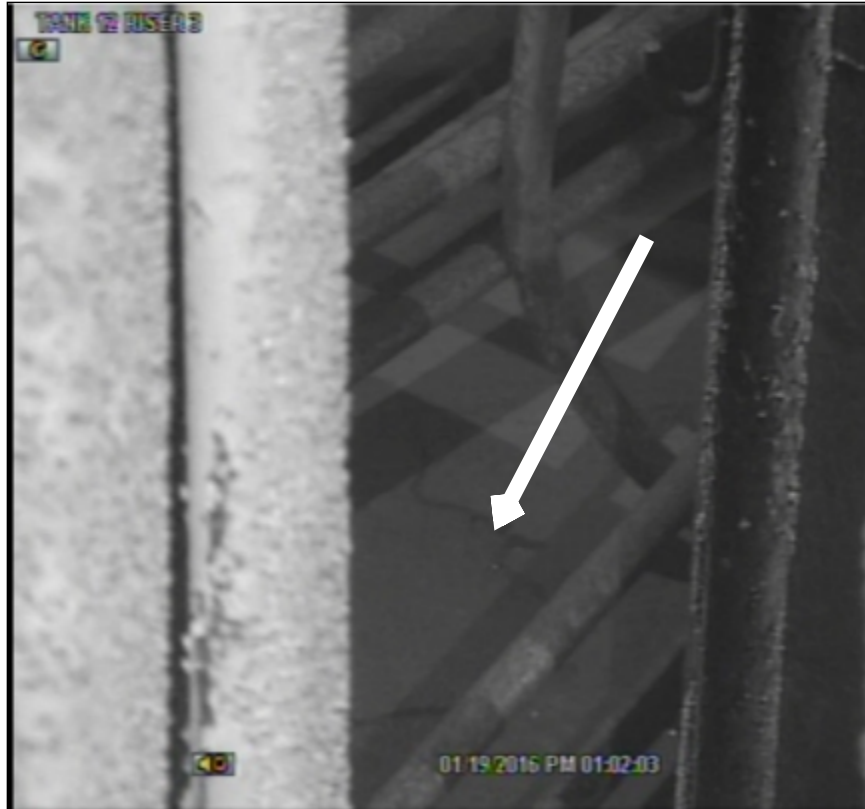
Figure 3. Photo of Bleed Water Segregation Occurring in Grout Poured into the Tank 12H Primary. The Dark Outline Surrounding a Freshly Deposited Lobe of Grout is Segregated Water Separating from the Grout Mass. Date of Video: January 19, 2016.

in pools at the tank wall beyond the amount introduced as slickline and tremie lubricant 7 (ADAMS Accession No. ML16231A444). Exposed grout lying above pools of water will hydrate in a relatively dry microclimate, whereas grout submerged under standing water at the tank perimeter will hydrate in a saturated microclimate; because of this, grout properties are unlikely to be uniform (ADAMS Accession No. ML13127A291). Tank grout that hydrates and hardens in a subaqueous environment may have different properties relative to that forming subaerially; although it is not entirely clear what environment will produce higher-quality, better-performing grout (ADAMS Accession No. ML16231A444). NRC staff recently reviewed the Tank 16H lessons learned document, which had a recommendation to analyze data from Tank 16H grout testing to develop an acceptable, non-zero range for bleed-water production.