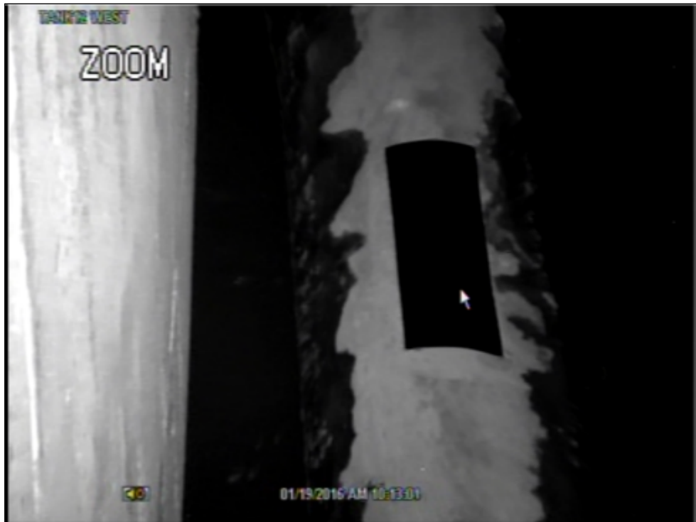
Figure 5. Photograph of Rectangular Ventilation Register in the Annulus, as viewed from the West Riser. Date of Video: January 19, 2016.

Improved visualization will increase the evidentiary support for ventilation duct voids having been filled, and will enhance DOE's ability to develop lessons learned related to grout placement strategies that will increase the likelihood that ducts are fully grouted and do not contain risk-significant void space (ADAMS Accession No. ML16231A444).